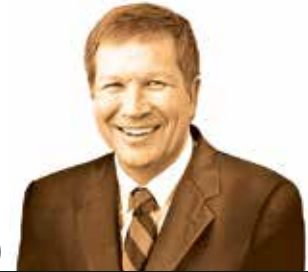
Gov. John Kasich (R)