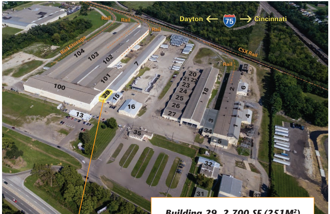
Building 29 2,700 SF (251M 2 )

2601 South Verity Parkway, Middletown, Ohio 45044